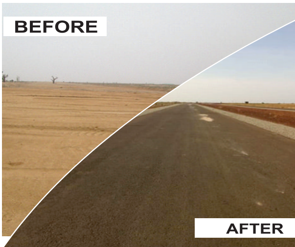
DUAL CARRIAGEWAY ON DAMATURU BY-PASS