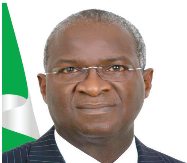
H.E. BABATUNDE RAJI FASHOLA, SAN MINISTER OF WORKS AND HOUSING