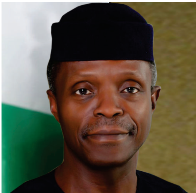
PROF. YEMI OSINBAJO GCON VICE PRESIDENT FEDERAL REPUBLIC OF NIGERIA