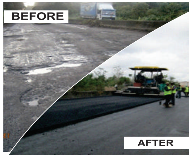
BENIN – ORE – SAGAMU DUAL CARRIAGEWAY

rehabilitation of Abuja-Abaji-Lokoja Dual-Carriageway (International Airport link road junction-Sheda Village Junction) in the Federal Capital Territory (FCT) has been fully completed.