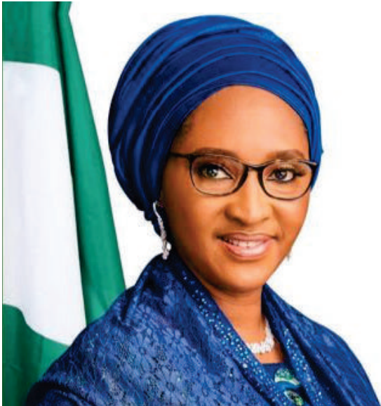
MRS. ZAINAB SHAMSUNA AHMED HON. MINISTER OF FINANCE, BUDGET & NATIONAL PLANNING