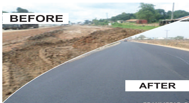
SULEJA - MINNA