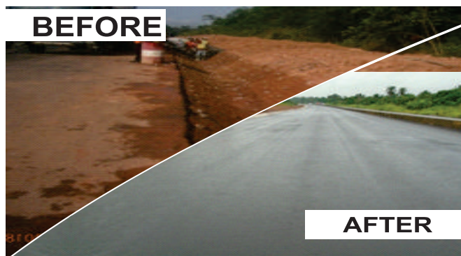
BENIN - OFOSU - ORE - AJEBANDELE -