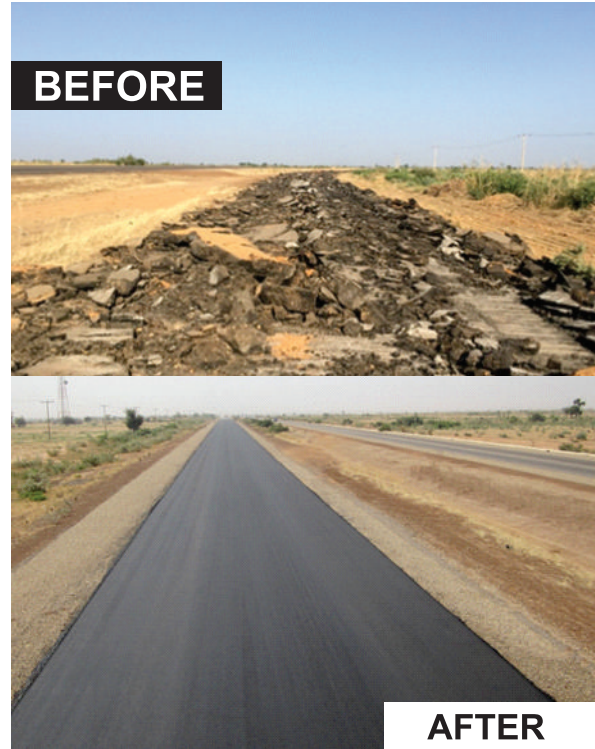
DUALIZATION OF KANO-MAIDUGURI ROAD