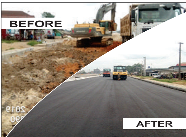
ENUGU - PORT HARCOURT DUAL CARRIAGEWAY