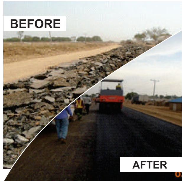
LAMBATA -LAPAI- BIDA ROAD